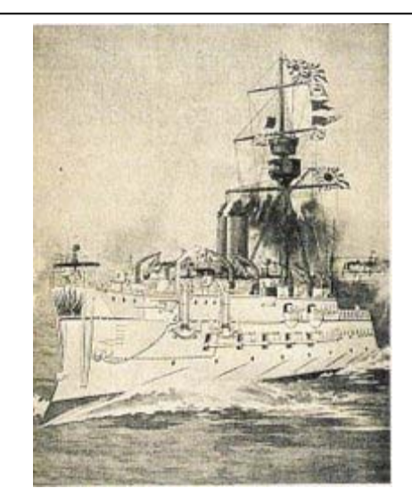
Matsushima, flagship of the Imperial Japanese Navy during the Sino-Japanese conflict.

Karate was to undergo an important transition during the Meiji Period. It was time to evolve away from its secretive and lethal past, and move into a new phase of public interest and contribution to society. Some felt that karate had much to offer to a rapidly changing society during the upheaval created by Meiji Period reforms.