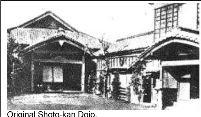
Original Shoto-kan Dojo.

work had also created a network for instruction throughout the country. With acceptance of karate by other established martial arts, and with a growing number of dedicated students, the introduction and popularization of karate in Japan was well underway.